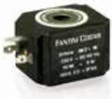
IM21D Control coil 12Vac 50/60Hz